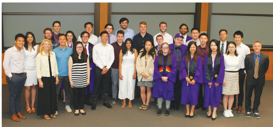
2019 Seniors pose for a final photo with their classmates.